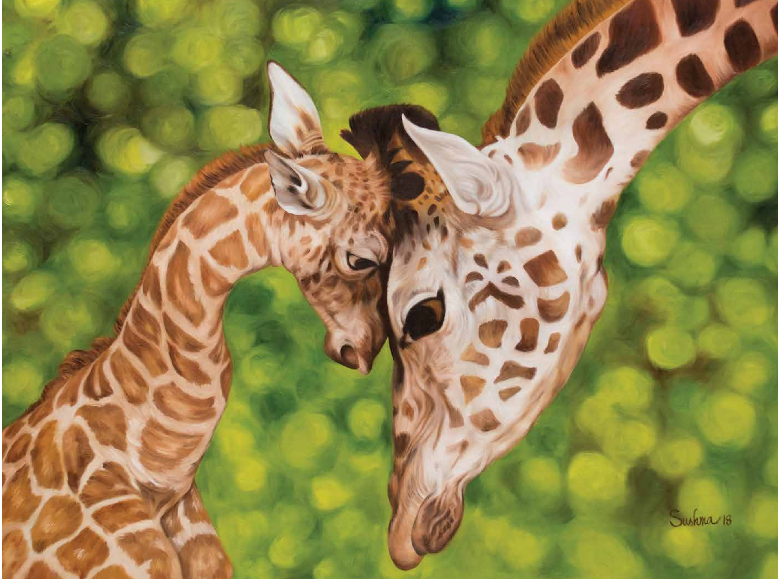
A MOMENT IN TIME