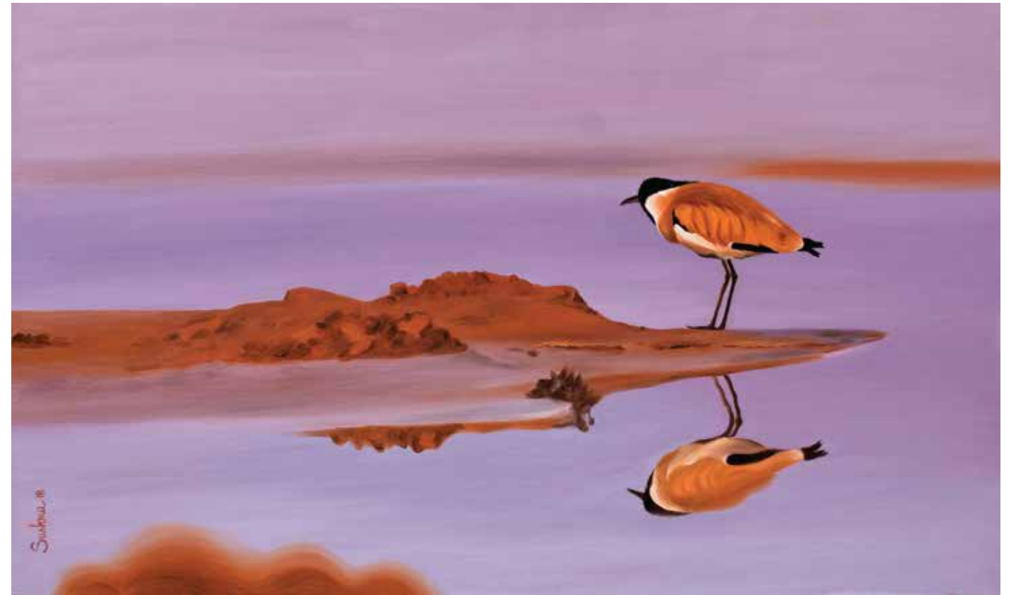
DISCOVER YOUR SHINE