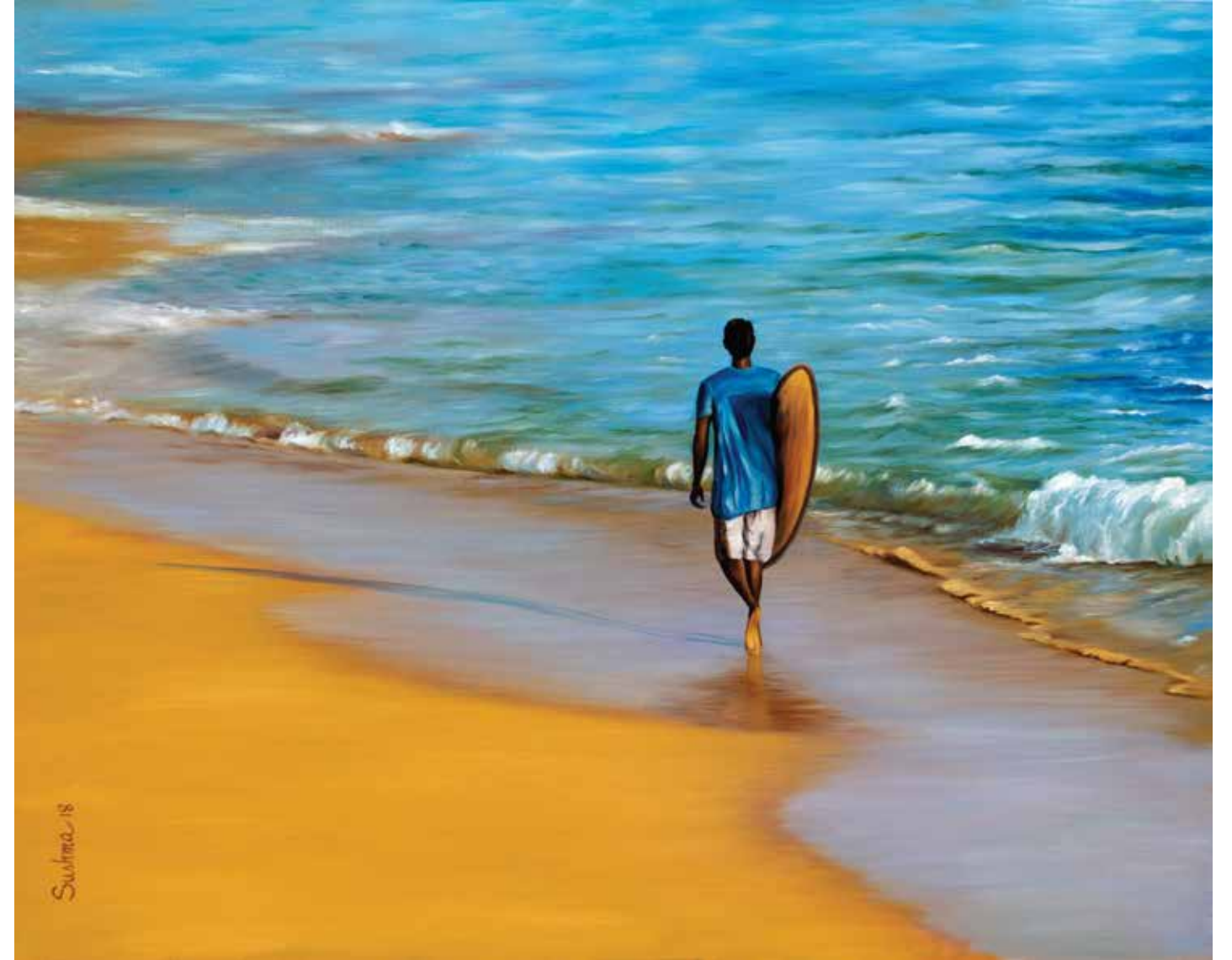
ONE WITH NATURE