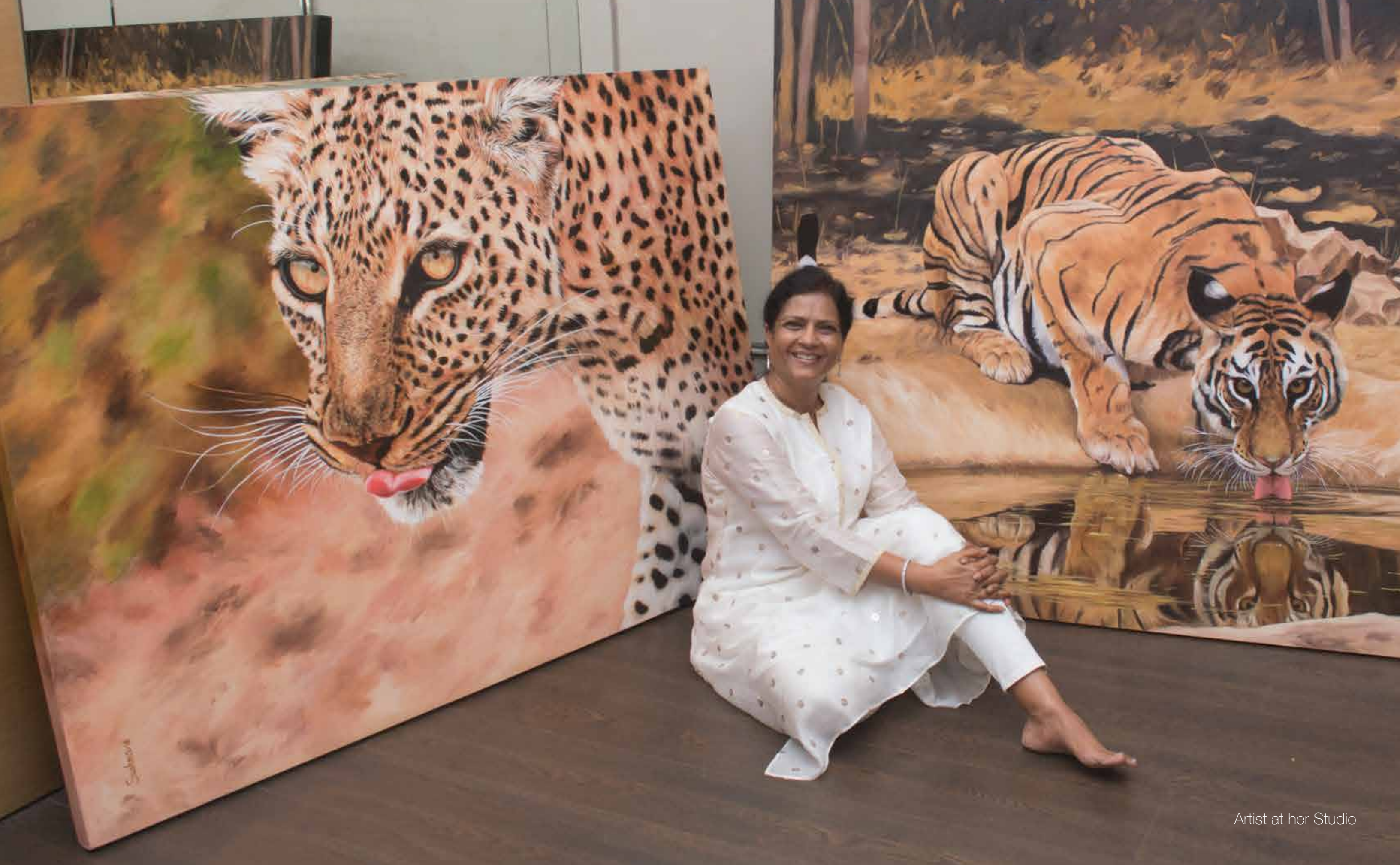
Artist at her Studio