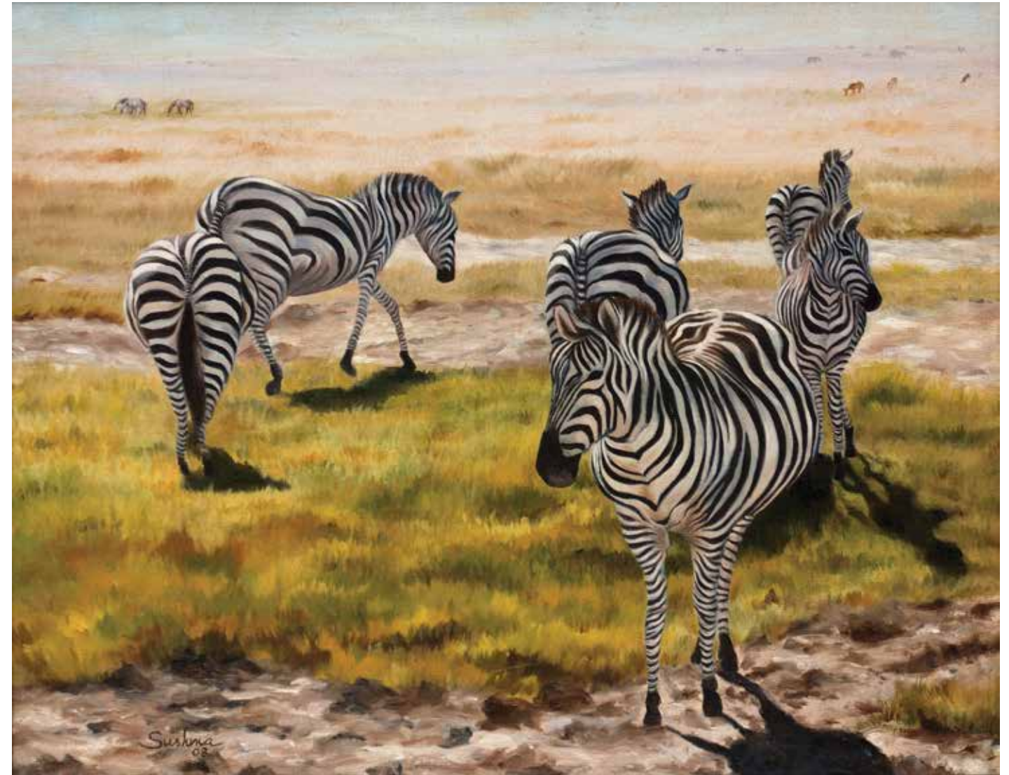
MY TRIBE oil on linen canvas, 24" x 30", 2008