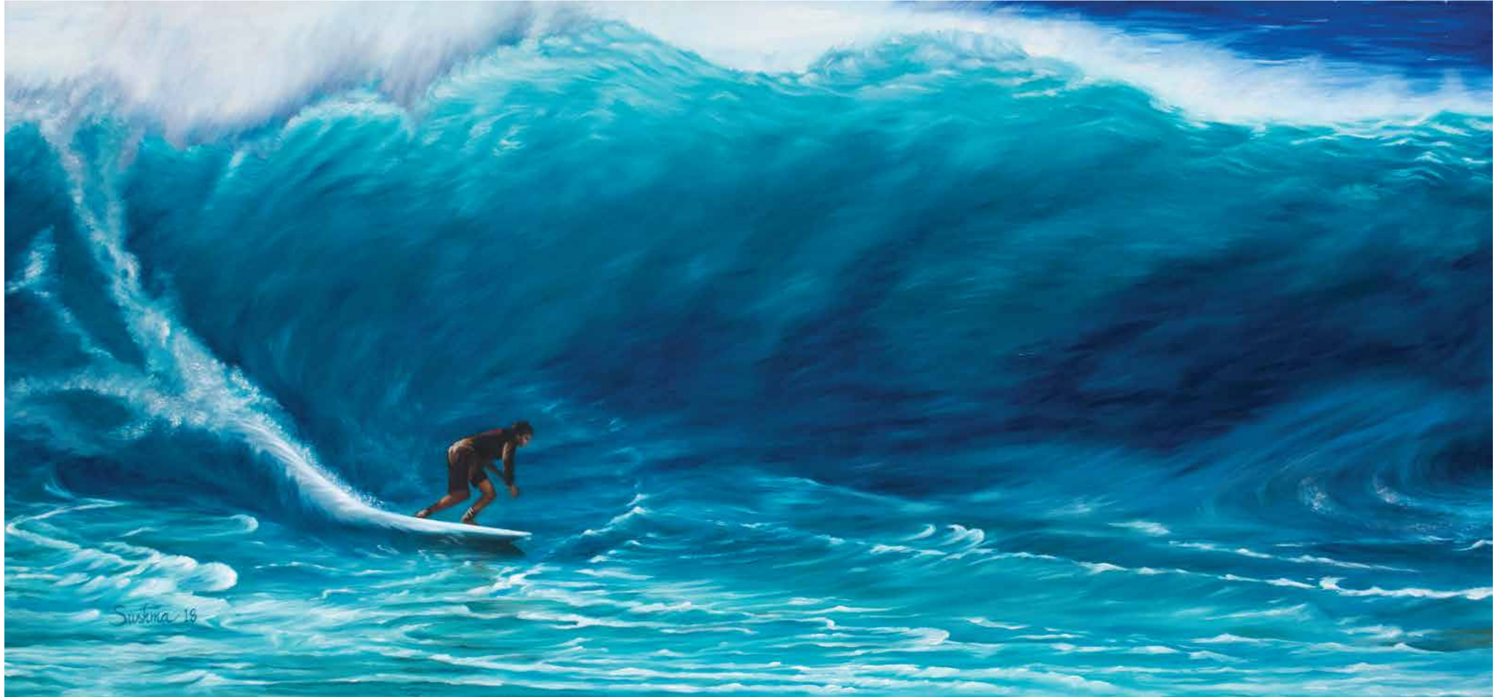
DALLIANCES WITH NATURE