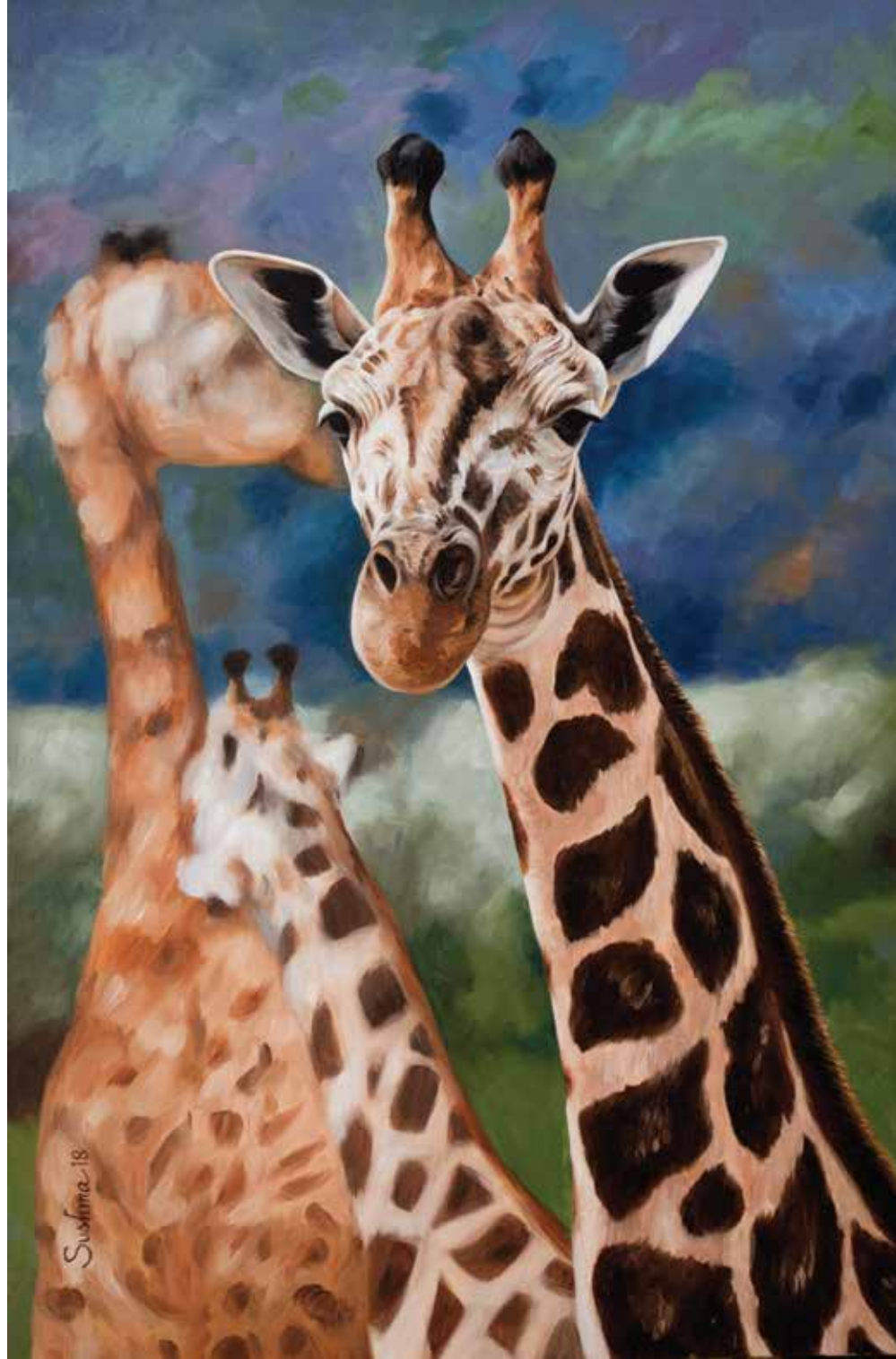
THE LONG AND SHORT OF IT