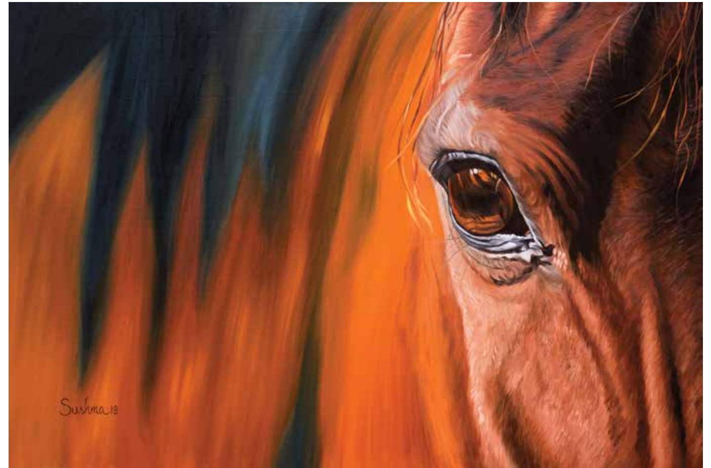
GO FOURTH UNAFRAID