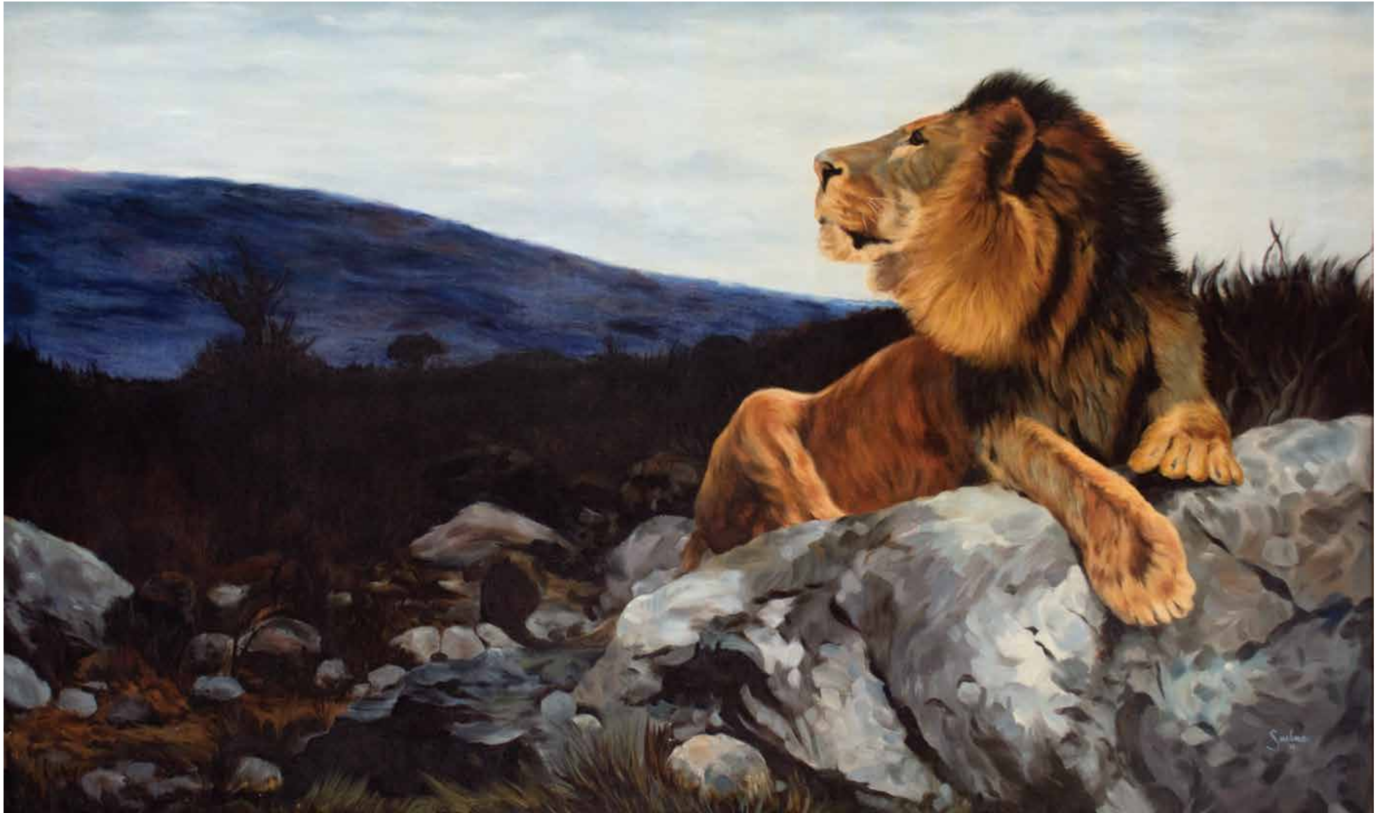
KING OF ALL I SEE