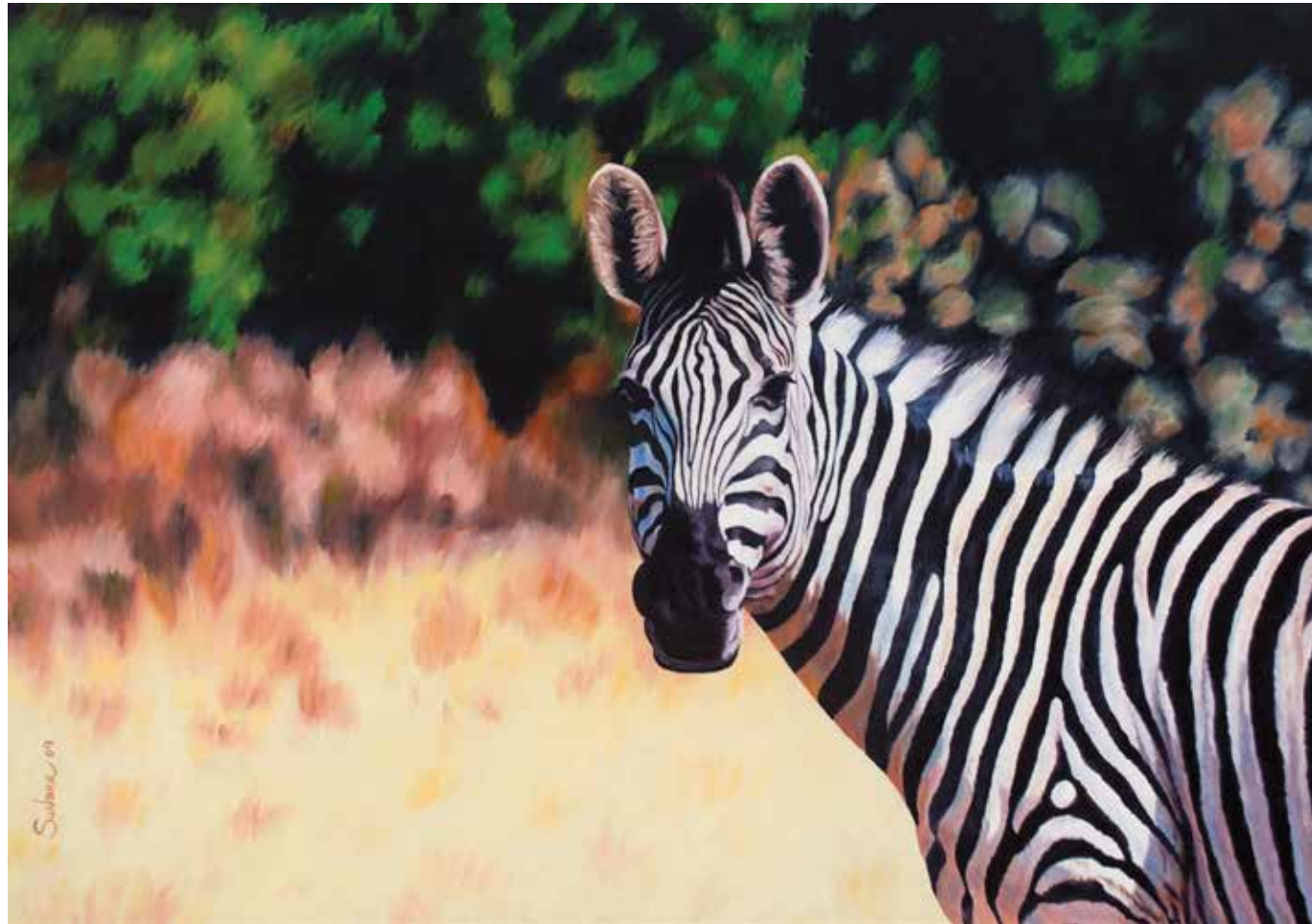
BETWEEN THE LINES