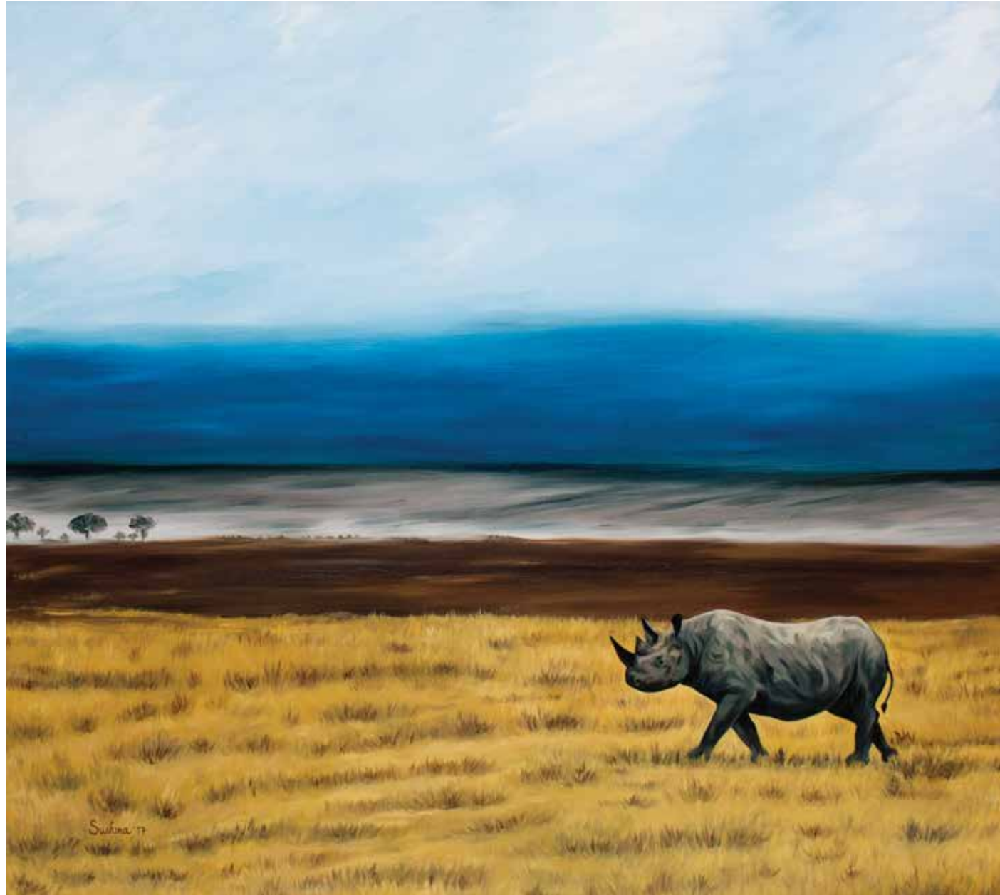
I GO ALONE oil on linen canvas, 56" x 63", 2017