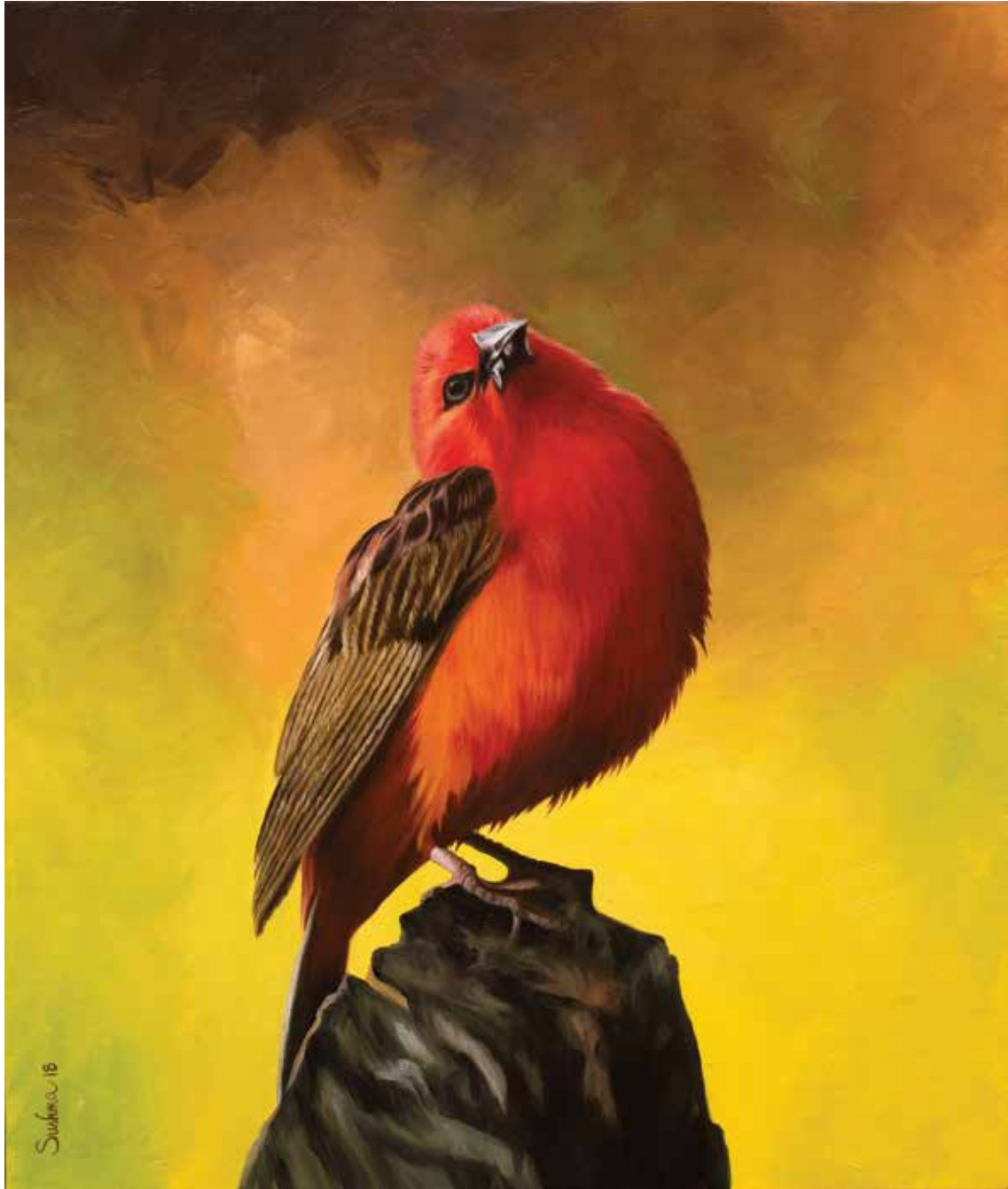
SWOLLEN WITH PRIDE