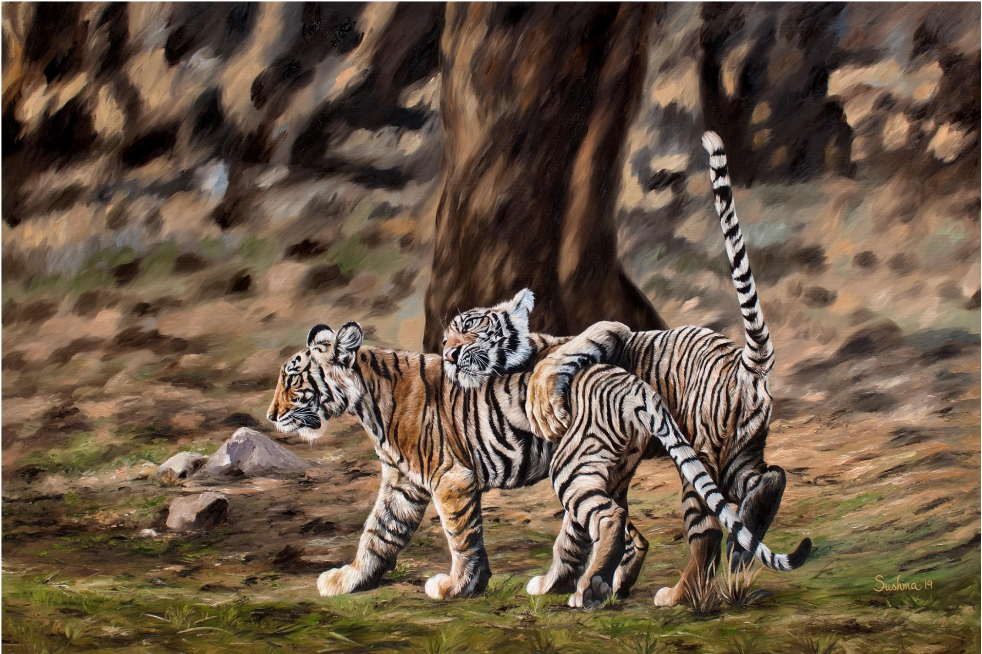
FOREVER YOURS Oil on Canvas, 72" X 48", 2019