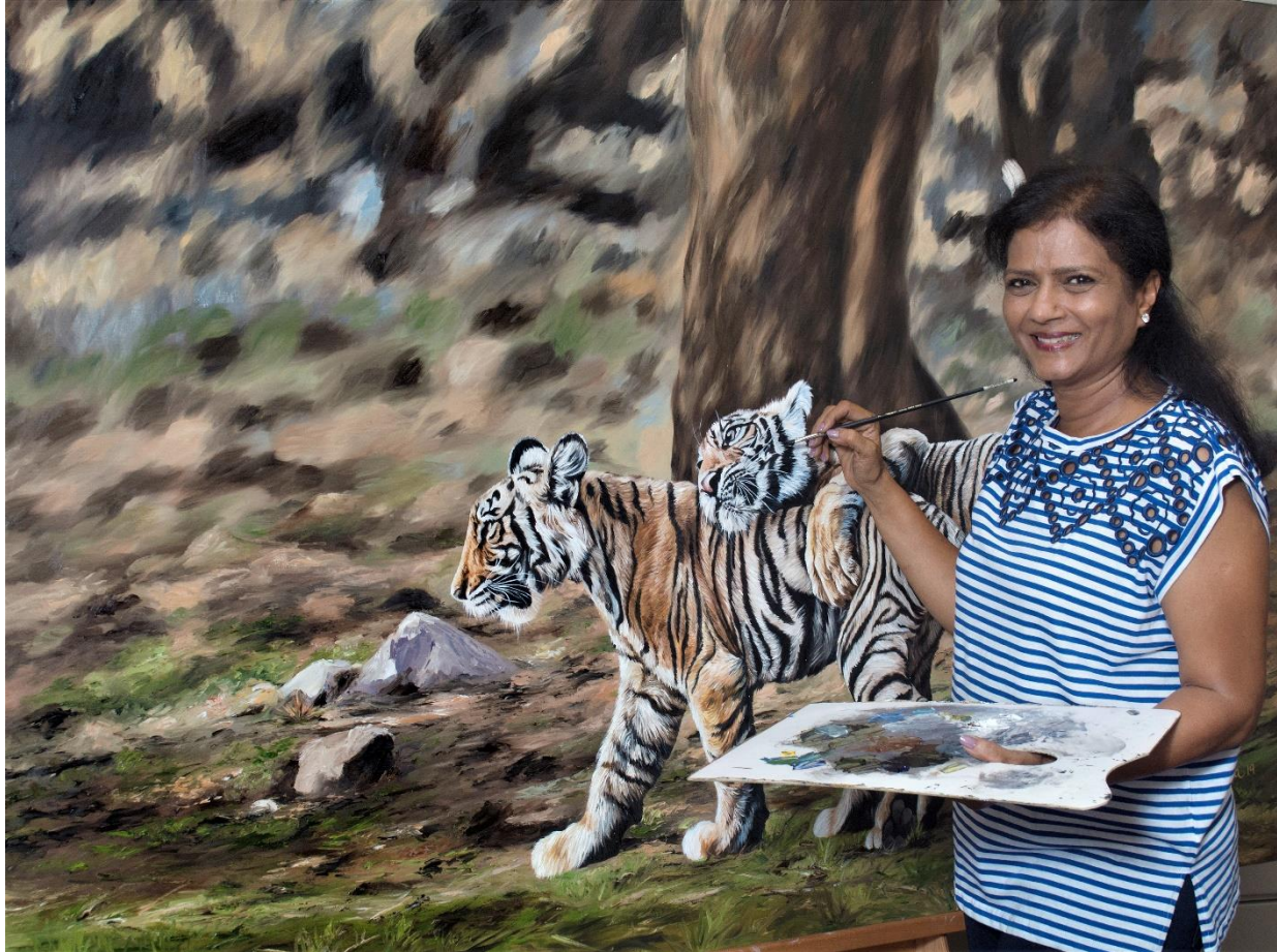
Artist in her Studio