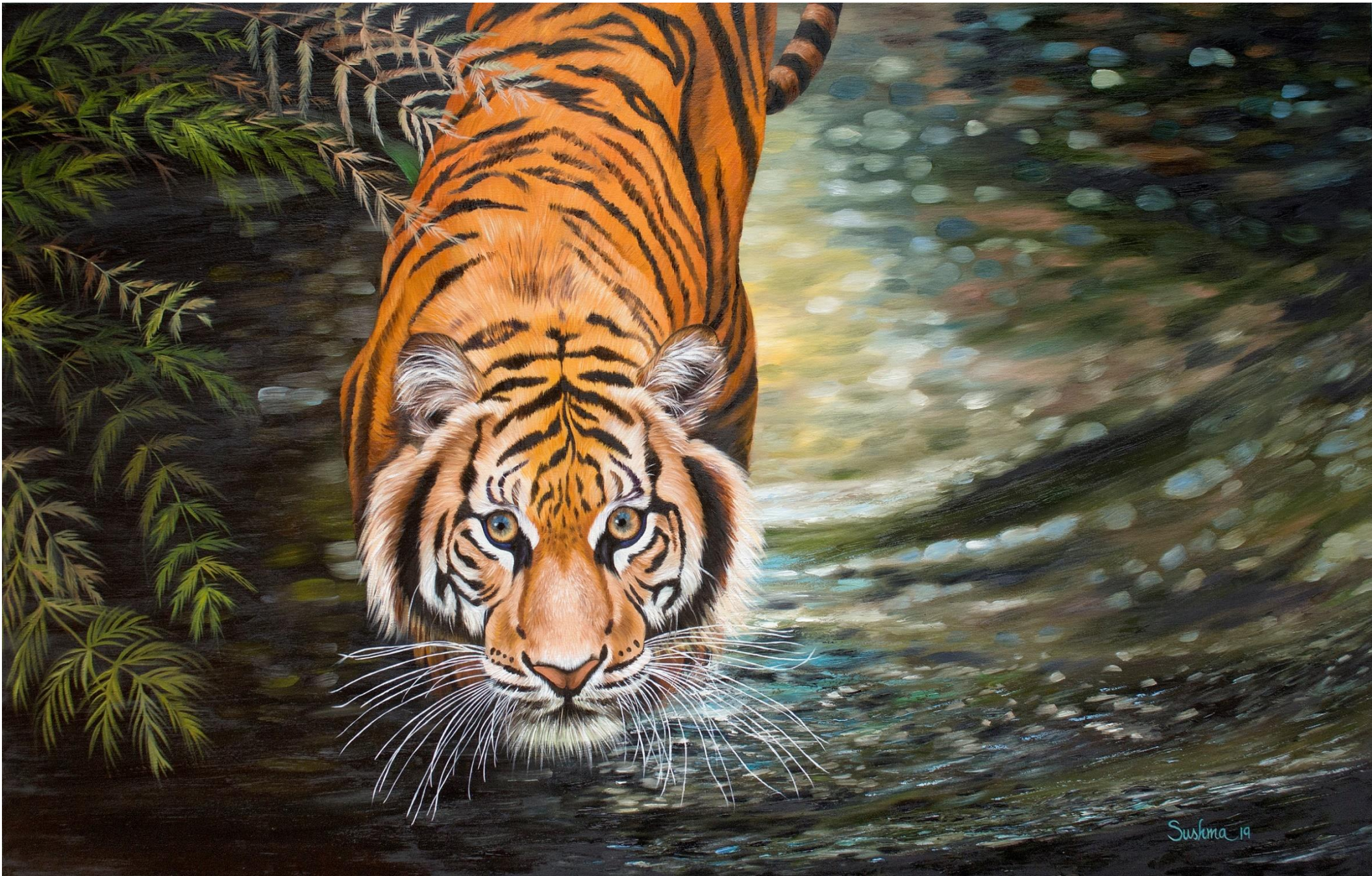
IN PURSUIT Oil on Canvas, 66" X 42" , 2019