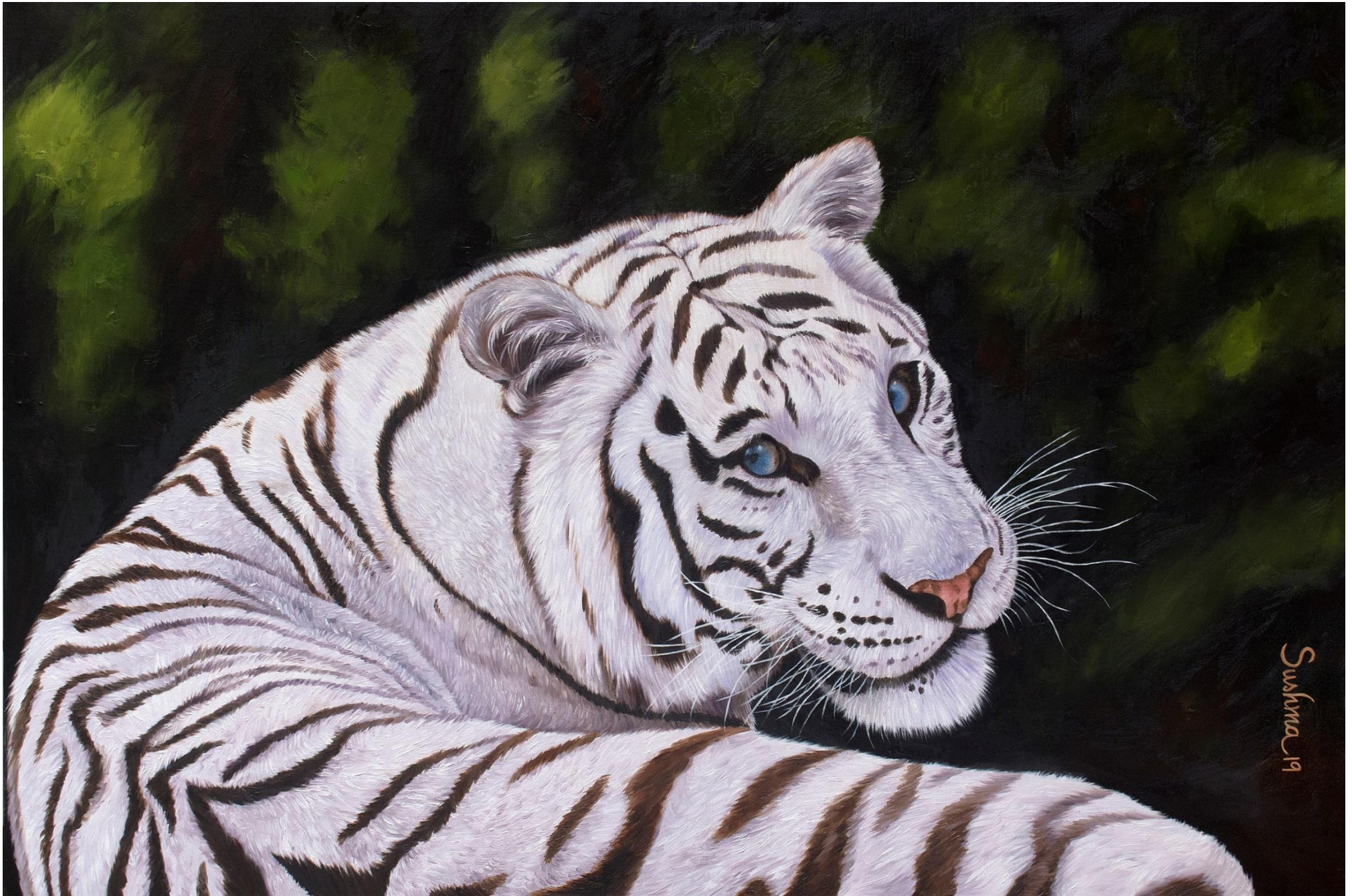
TURN BACK TIME Oil on Canvas, 48" X 32", 2019