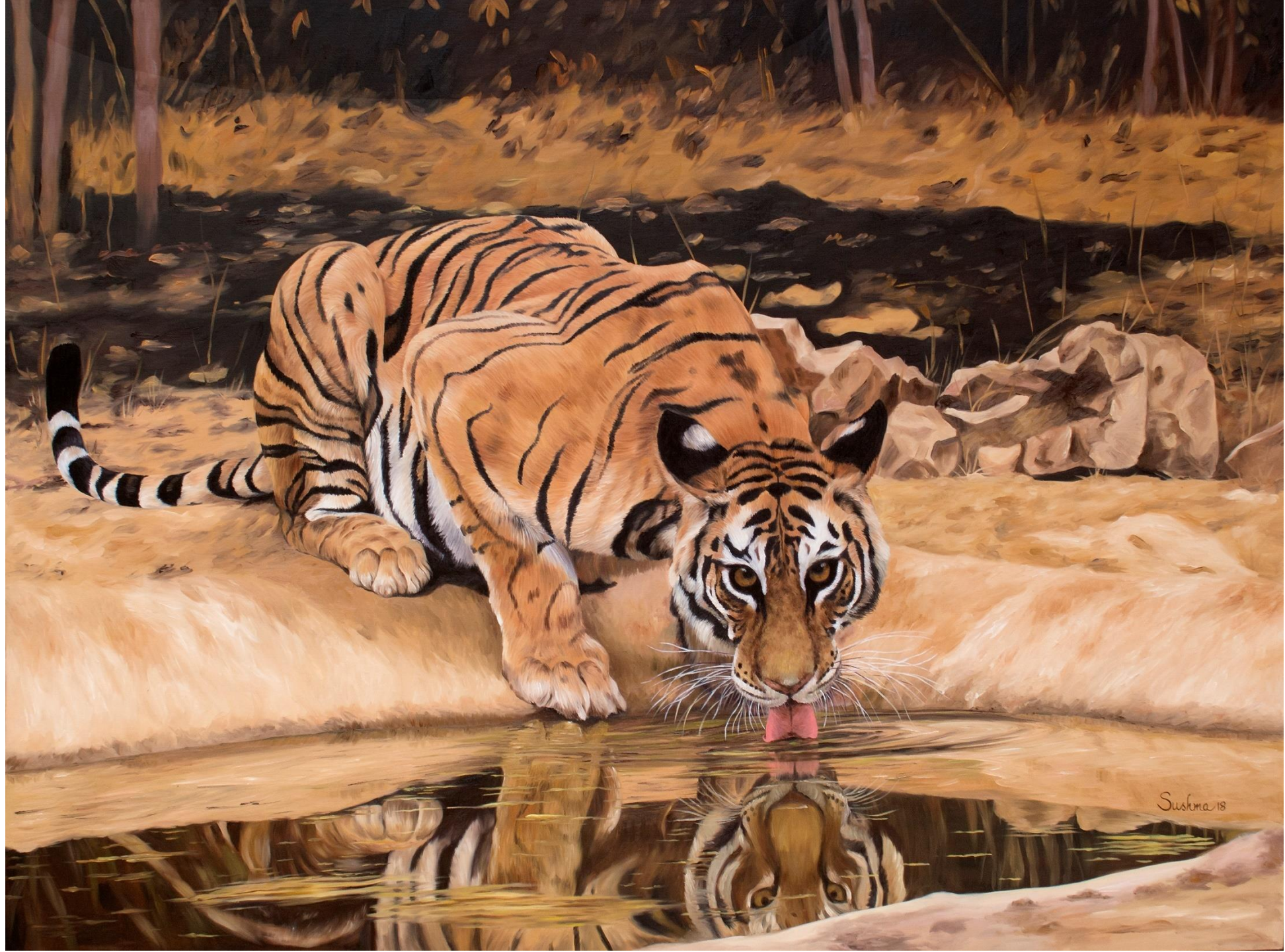
SATIATED Oil on Linen Canvas, 52" x 70", 2018