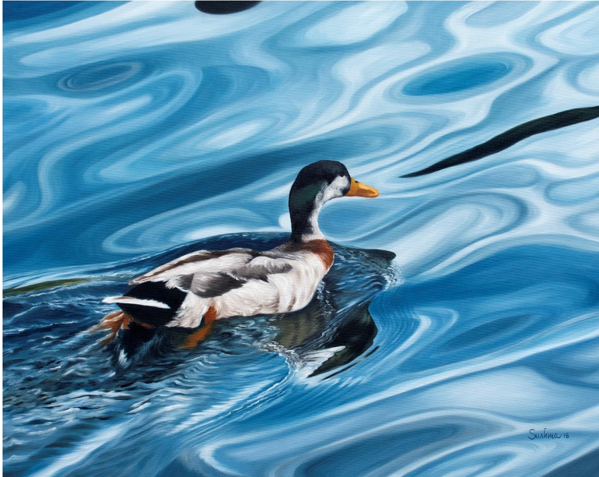
RIPPLE EFFECT Oil on Linen Canvas, 32" x 40", 2018