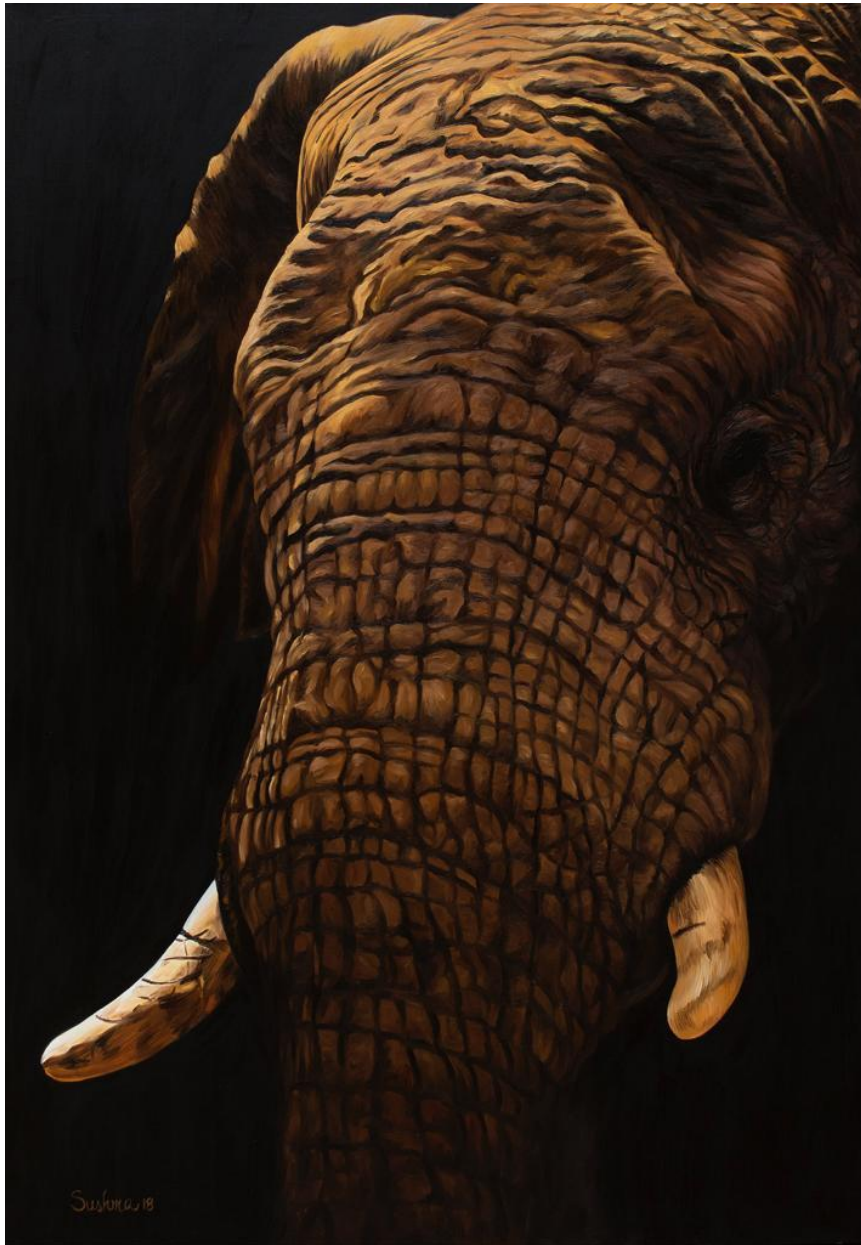
TIME REMEMBERED Oil on Linen Canvas, 48" X 34" , 2018