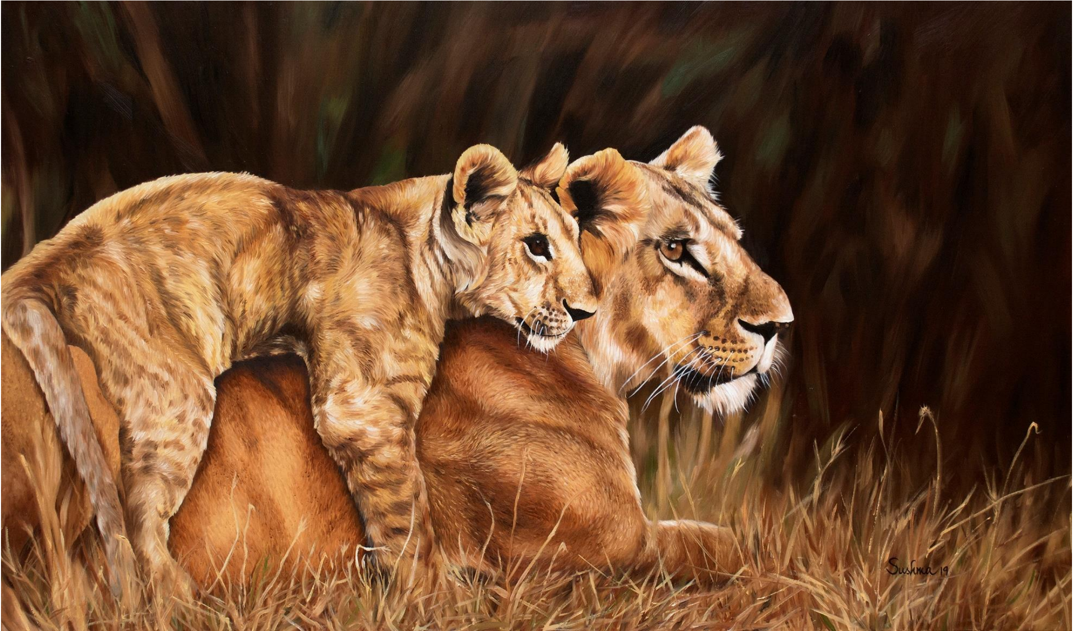
WHERE LOVE BEGINS Oil on Canvas, 36" X 60", 2019