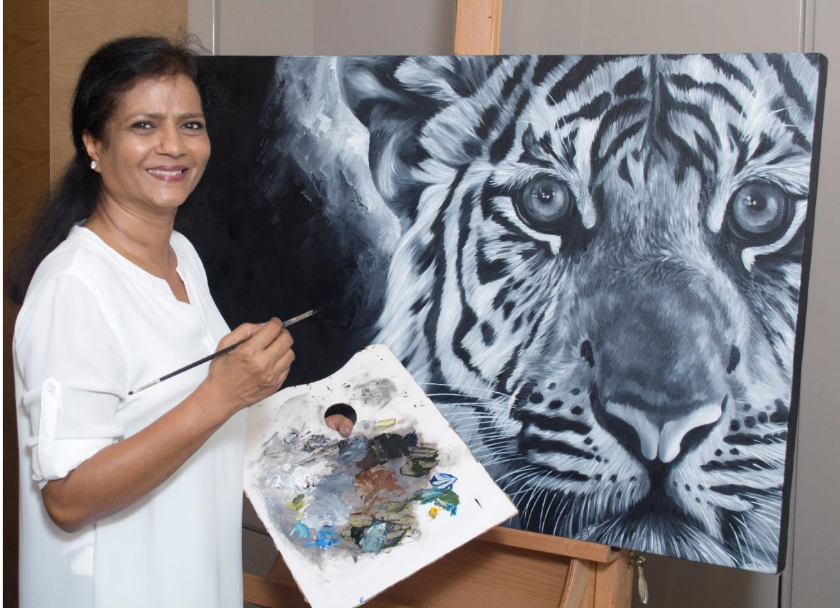
Artist at her Studio

“I love animals and through my art, I want to transfer that love to other people. When I see wild animals, I fall in love with them. Seeing animals in their full glory, in the natural environment, makes me really happy, and I try to bring those emotions on canvas..