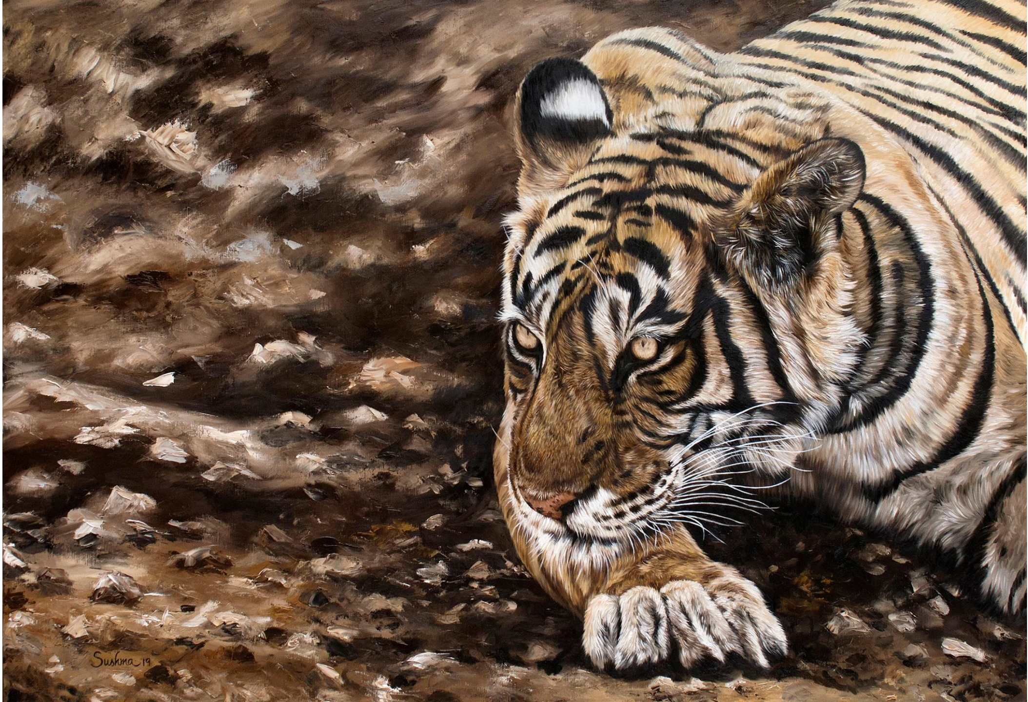
SEEKING Oil on Canvas, 58" x 40", 2019