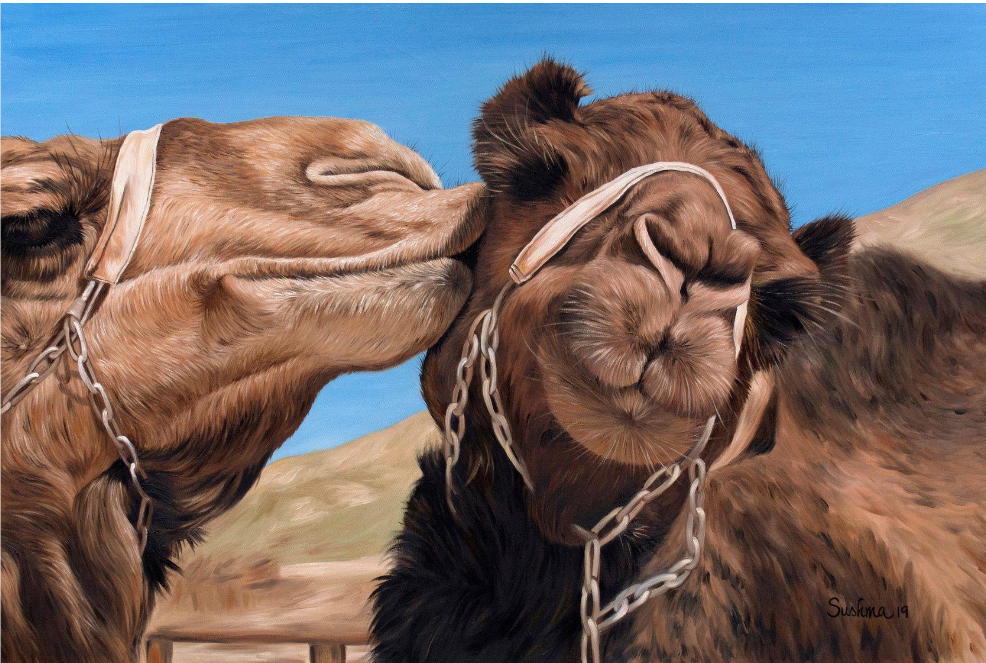
UNSHACKLED Oil on Canvas, 28" X 42" , 2019