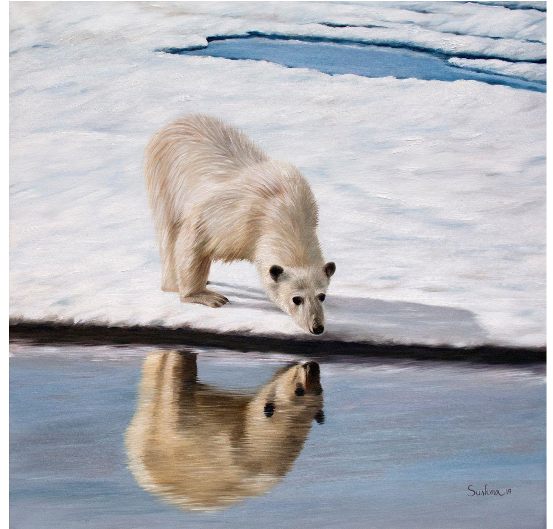
INSIDE THE SILENCE Oil on Canvas, 33" x 32", 2019