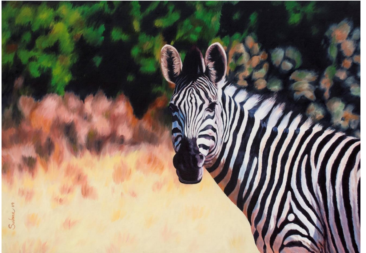
BETWEEN THE LINES Oil on Linen Canvas, 32" x 46", 2009