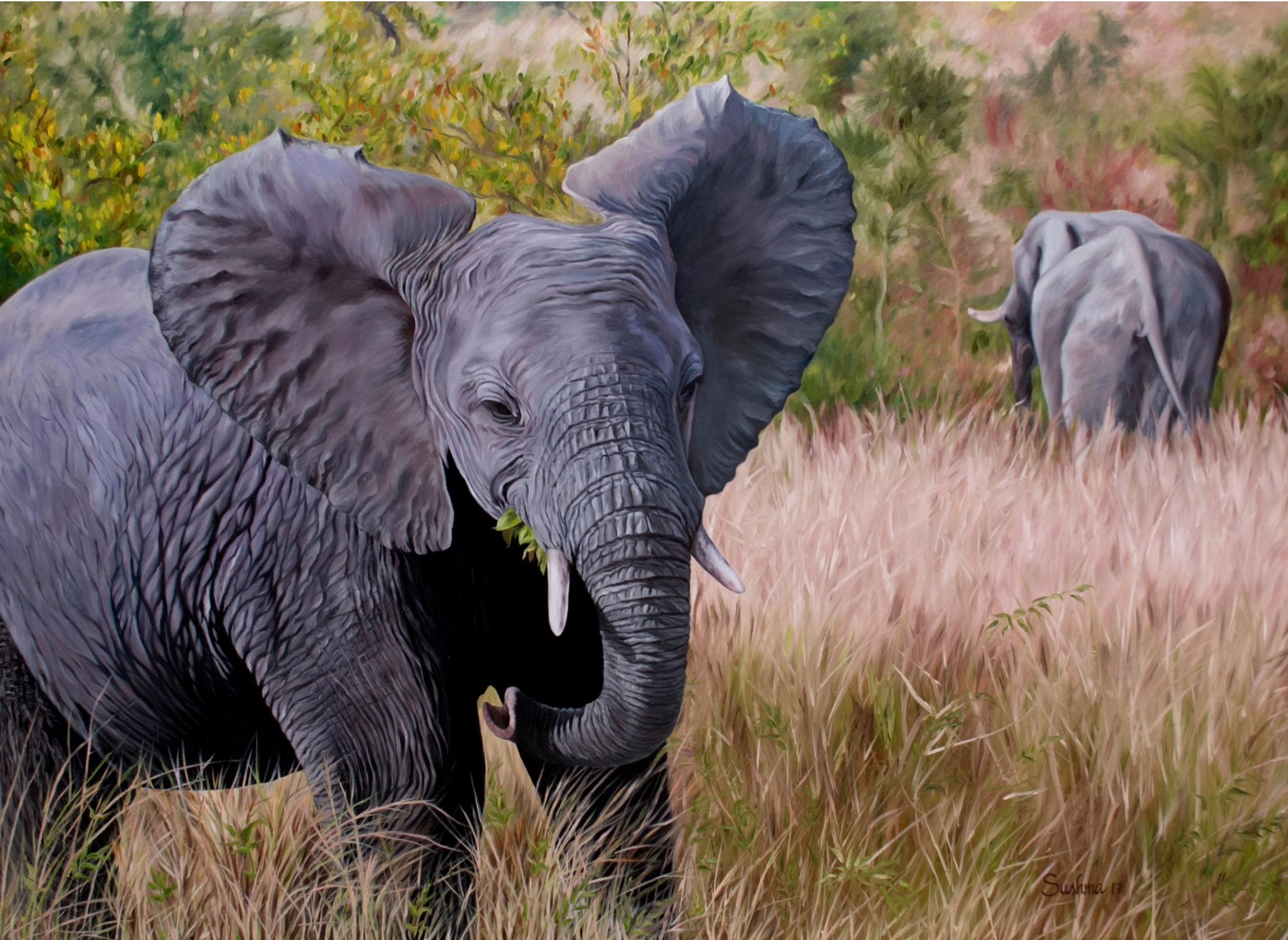
GENTLE GIANTS Oil on Linen Canvas, 50" x 69", 2017