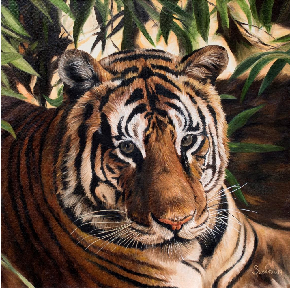
ROYAL STRIPES Oil on Canvas, 25" x 25", 2019