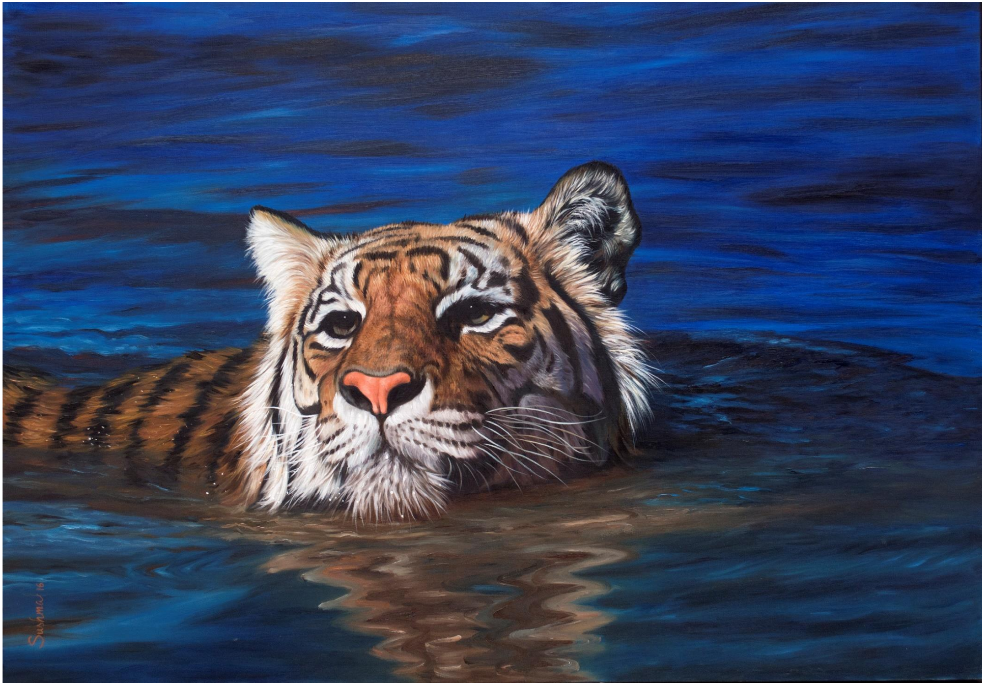
VOYAGE WITHIN Oil on Linen Canvas, 40" x 58", 2016