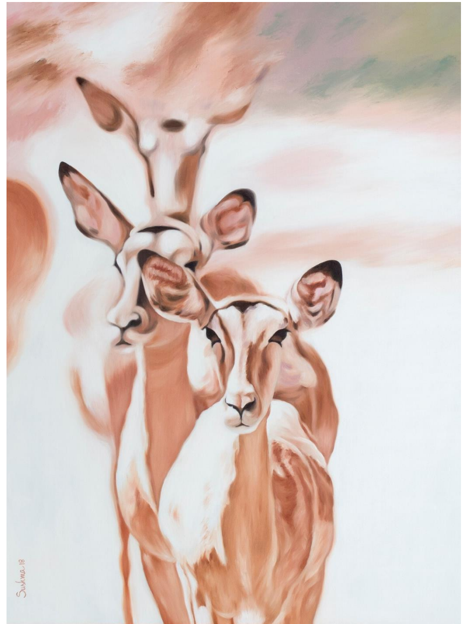
MYSTICAL ENCOUNTERS Oil on Linen Canvas, 50" X 38" , 2018