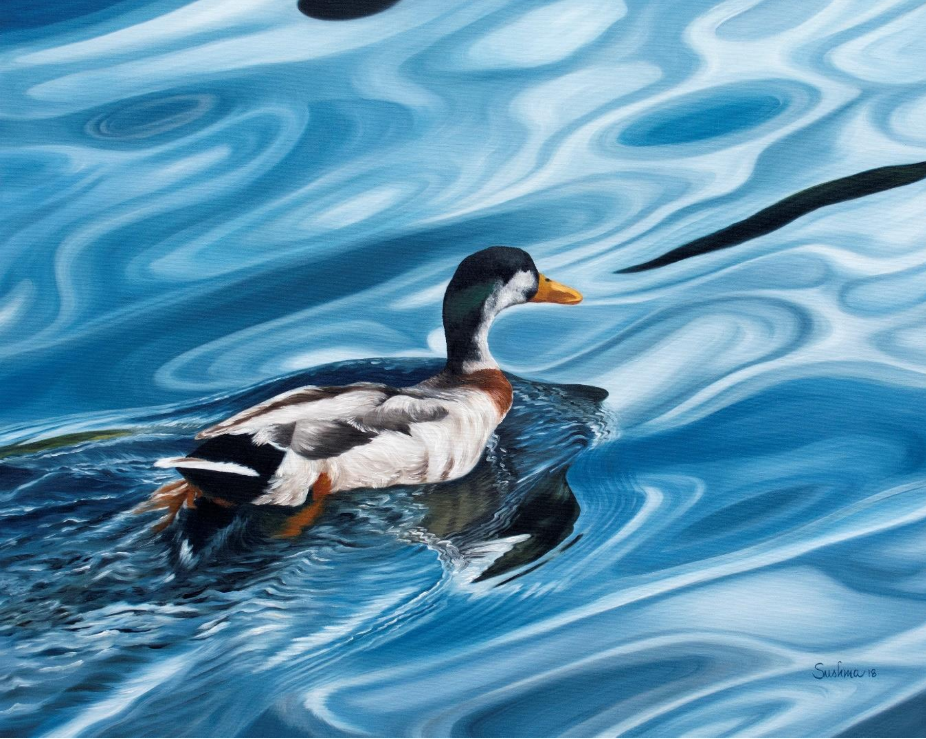
RIPPLE EFFECT Oil on Linen Canvas, 32" x 40", 2018