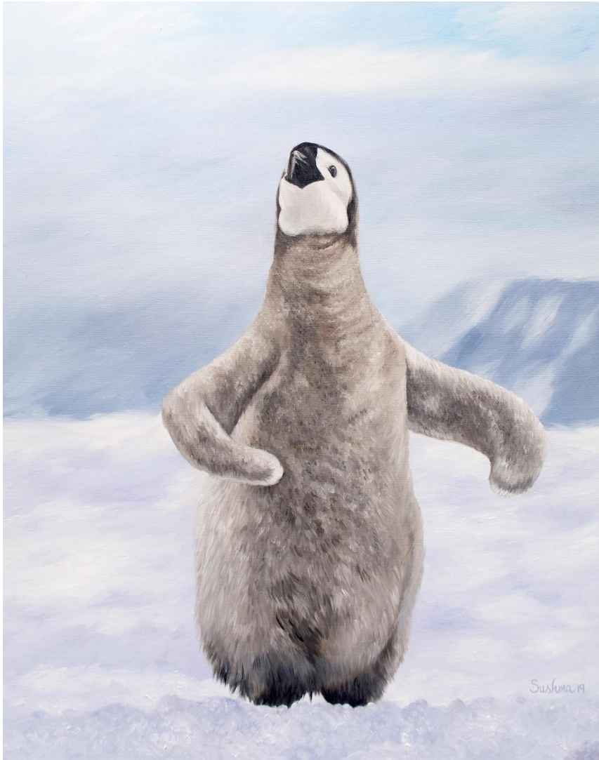
HAPPY FEET Oil on Canvas, 35" x 28", 2019