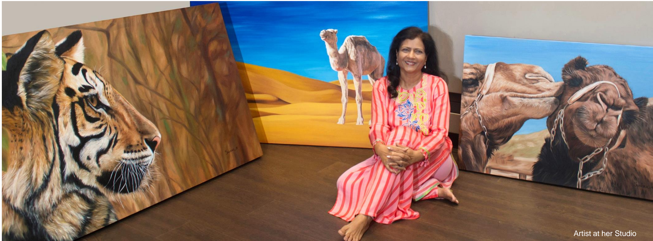
Artist at her Studio

“I love animals and through my art, I want to transfer that love to other people. When I see wild animals, I fall in love with them. Seeing animals in their full glory, in the natural environment, makes me really happy, and I try to bring those emotions on canvas..